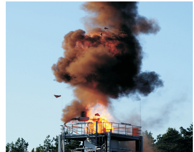
Dust explosion at BAM TTS

European Commission, Research & Innovation – Industrial Technologies http://ec.europa.eu/research/industrial_technologies